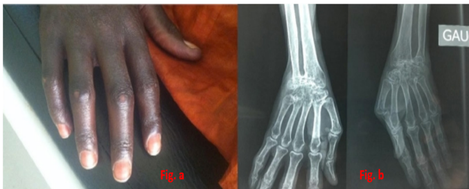
Figure 4: a. (Scleroderma patient); b. (PR patient, more severe bilateral carpalitis on the right).